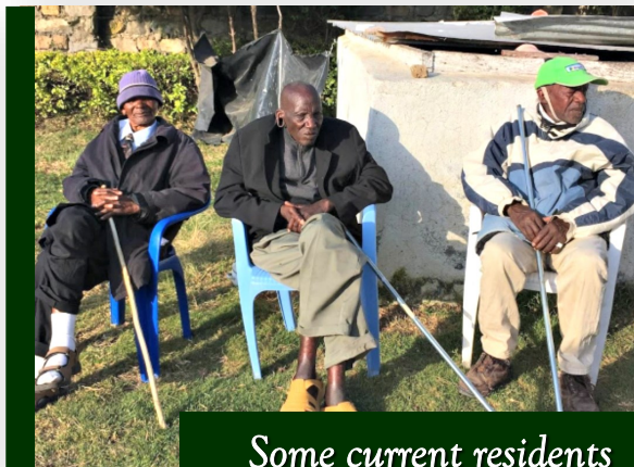
Some current residents