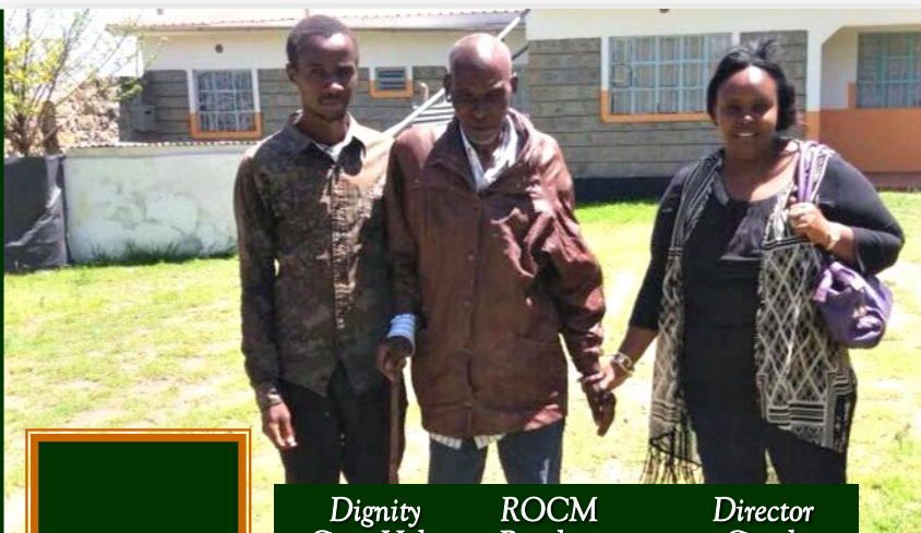
Dignity Care Helper